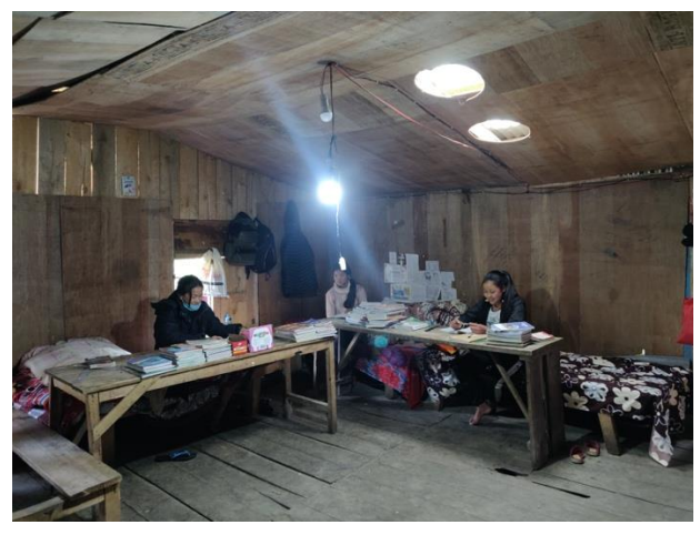
Students studying in their bedroom