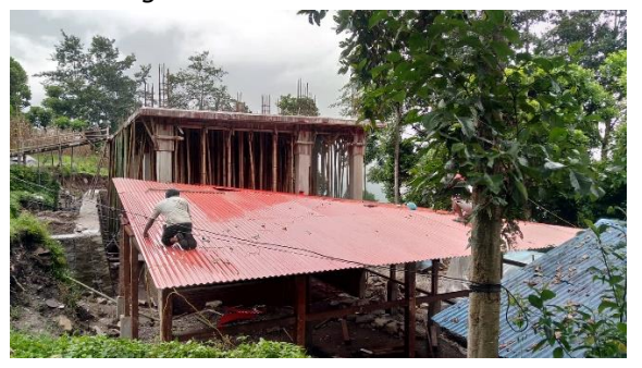
{\it CGI \, roof \, installation \, of \, the \, dining \, area}