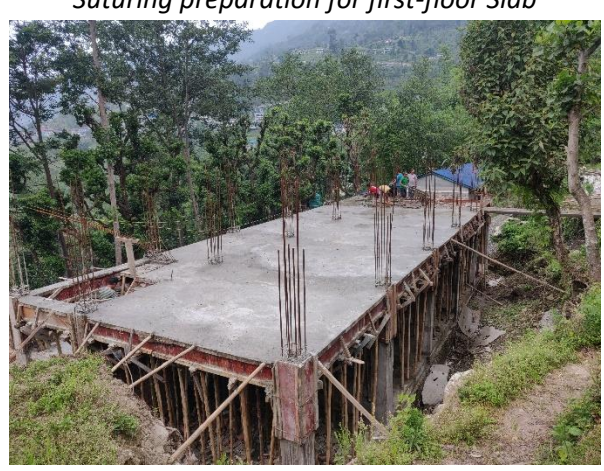
Completion of first-floor slab