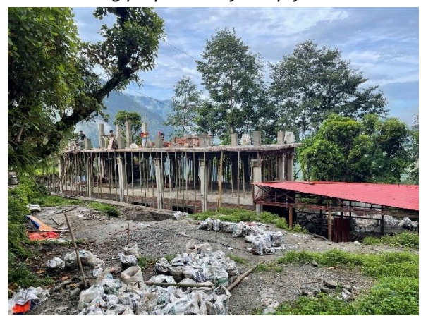
Back side views of the building