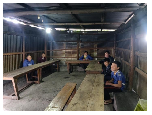
A temporary dining hall attached to the kitchen