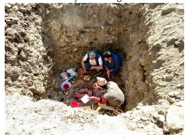
Puja at inogration date 10<sup>th</sup> Dec, 2022

The following photographs show the present condition of the Himali Hostel Construction Project during the construction time frame.