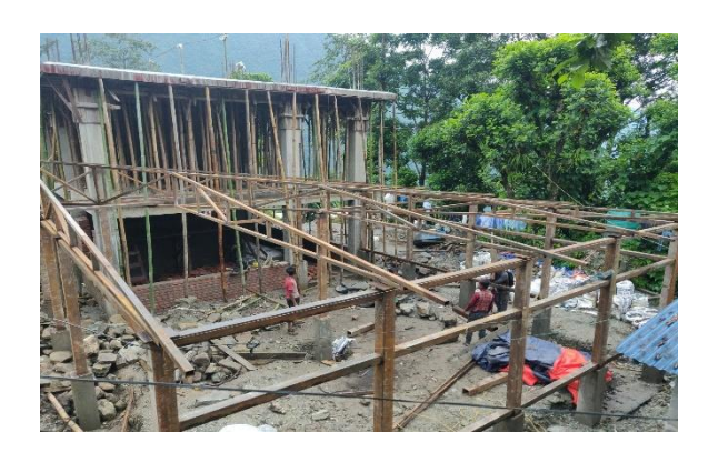
Steel Truss work at the dining area