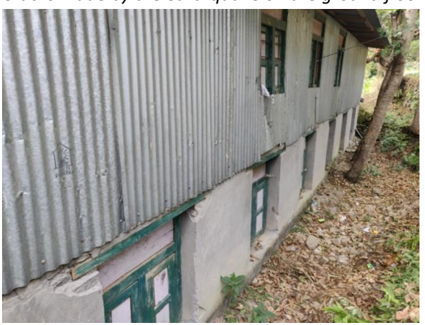
Back view of the hostel