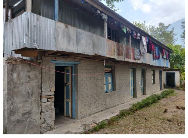
Front view of the hostel with earthquake damaged