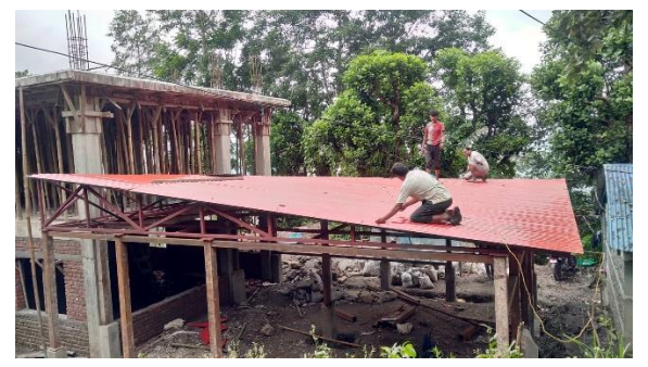
{\it CGI \, roof \, installation \, of \, the \, dining \, area}