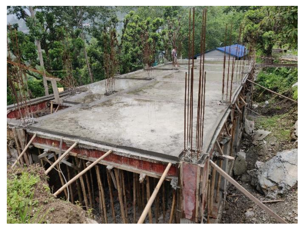
Curing of the slab after completion