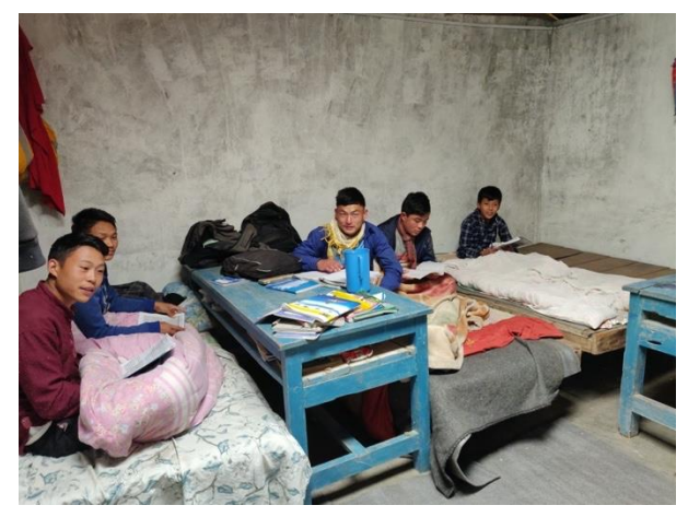
Students in their bedroom