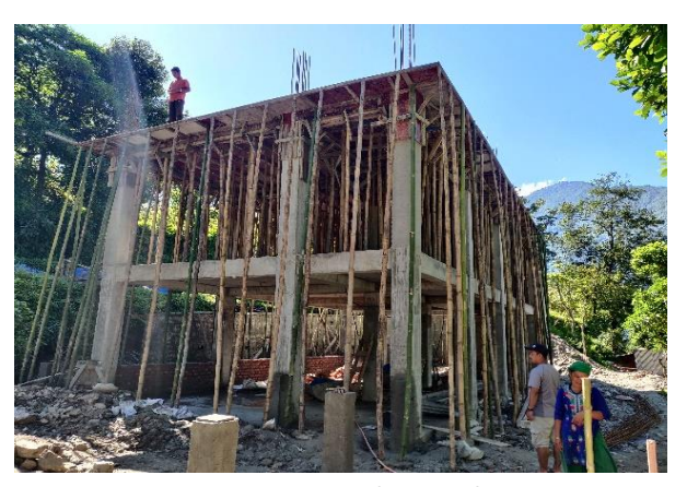
Suturing preparation for top-floor Slab