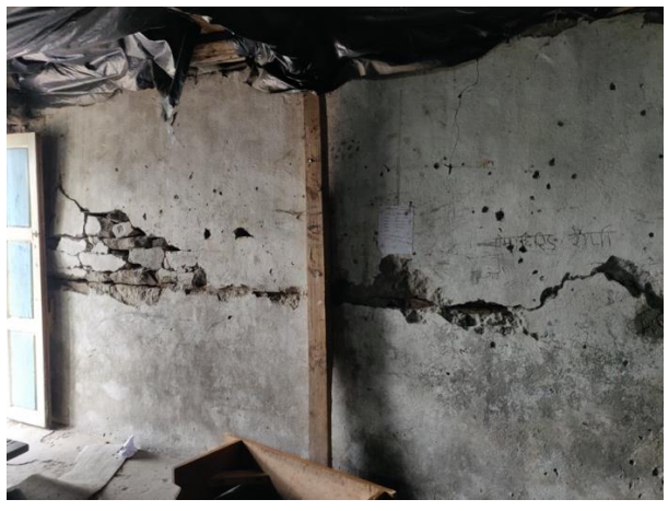
Cracks made by the earthquake on the ground floor