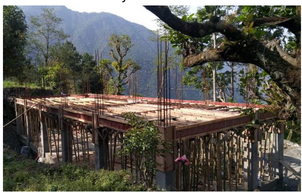
Suturing preparation for first-floor Slab