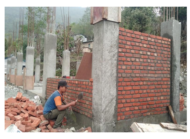
Column and Brickwork