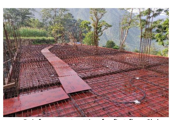
Reinforcement setting for first floor Slab