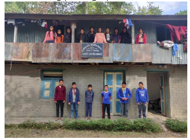
Current students staying at the hostel

The following photographs show the Past condition of the hostel before construction