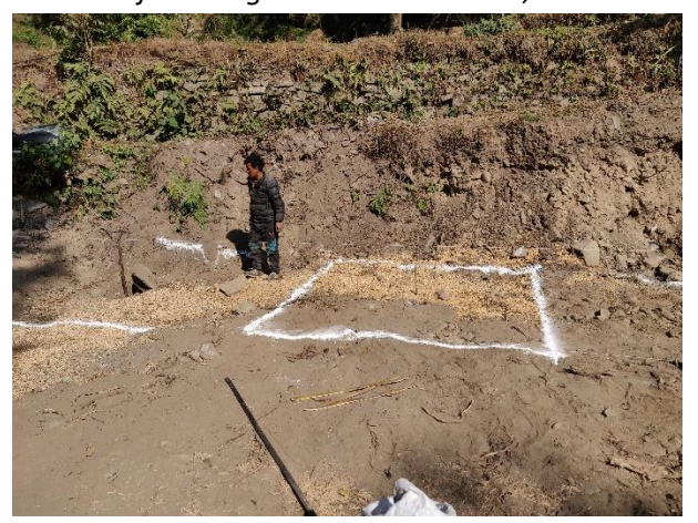
Tranch Setting for the foundation work