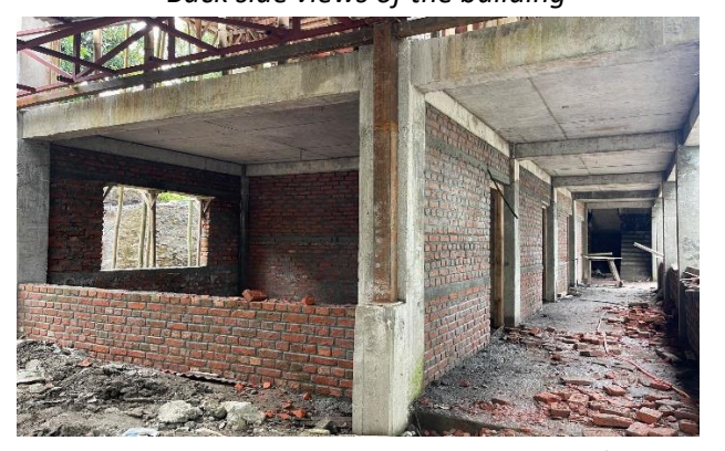
Brick masonry wall work on the ground floor