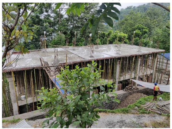
Slab cast of top-floor