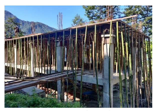
Suturing preparation for top-floor Slab