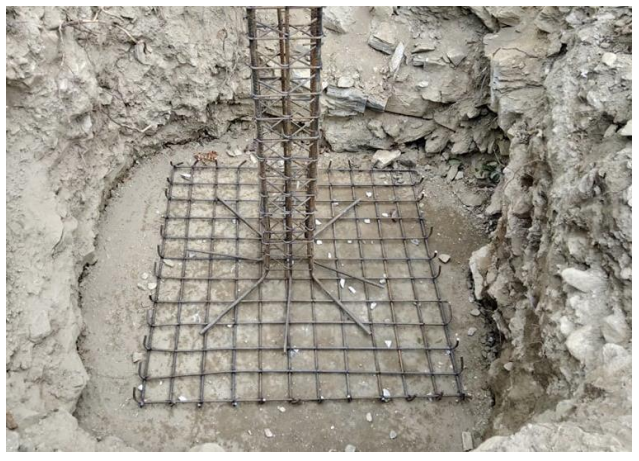
The setting of Reinforcement in the column at the foundation