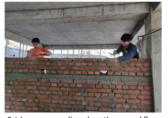
Brick masonry wall work on the ground floor