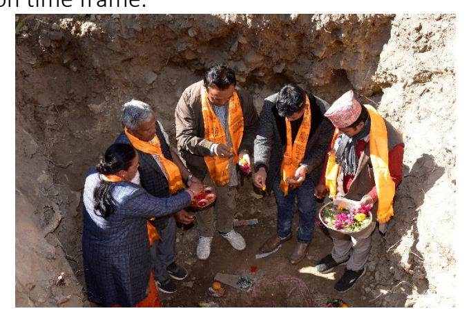
Puja at inogration date 10^{th} Dec, 2022