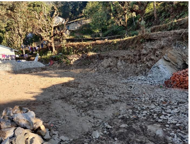
Fig: Before and after site clearance of construction area